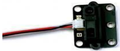
Figure 2: Photo of the Botball sensor used in this experiment [5].

The exact model number of the ET sensor could not be identified because Botball does not publish that information on their website. However, based on appearance and specifications of the sensor and searching the internet, the sensor is believed to be the Sharp model GP2Y0A21YK0F with a range of 10 – 80 cm.